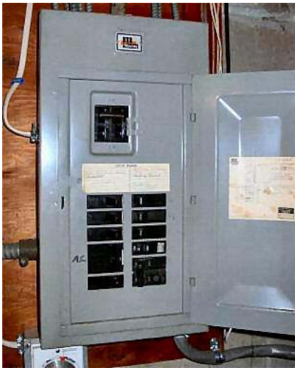
Standard Breaker Box